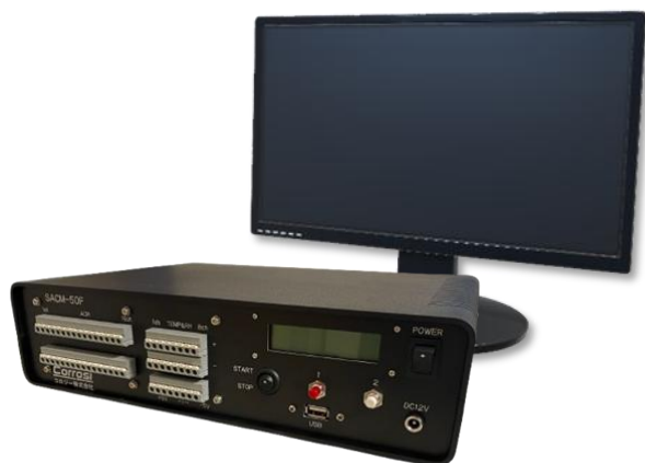
Enlarged View of Sensor Connection (SACM-50F)