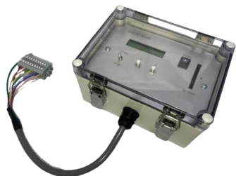
SACM-312B/314B (Main Unit)