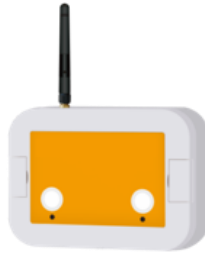
Main Unit (Standard Type) ※1