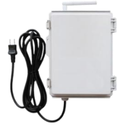
Main Unit (Waterproof Type) ※1