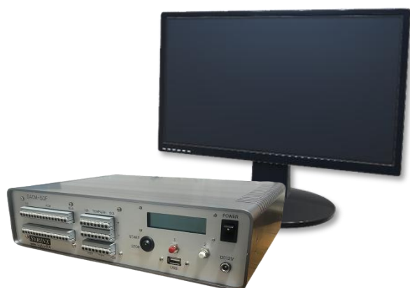
Enlarged View of Sensor Connection (SACM-50F)